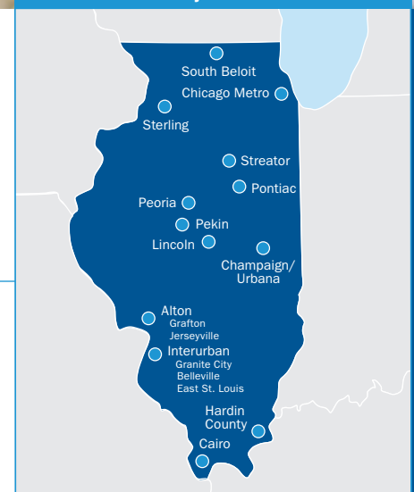
Illinois • Major Service Areas

At Illinois American Water, a team of over 500 employees in 13 operating districts work every day to provide quality water and wastewater services to approximately 1.3 million Illinois residents. Illinois American Water has five regional offices in the state: Alton, Chicago Metro, Peoria, Champaign County and Interurban (Belleville/Metro East).