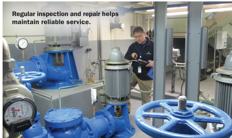
Regular inspection and repair helps maintain reliable service.